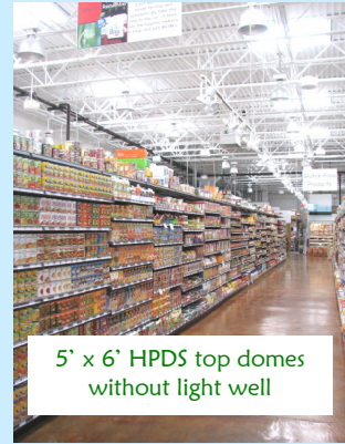
5' x 6' HPDS top domes without light well